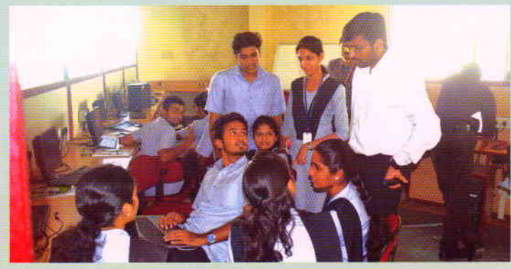
Workshop on "Practical Aspects of Networking" in association with Grey Technolabs on 9th October 2015.