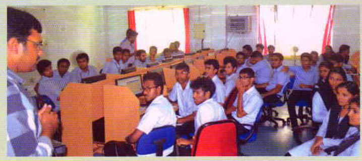
Workshop on "LabView" in association with Silica Tech on 9th October 2015.