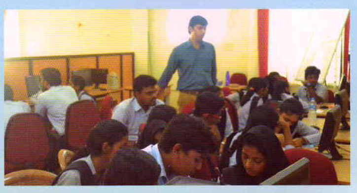
Workshop on "Arduino" in association with Grey Technolabs on 7th October 2015